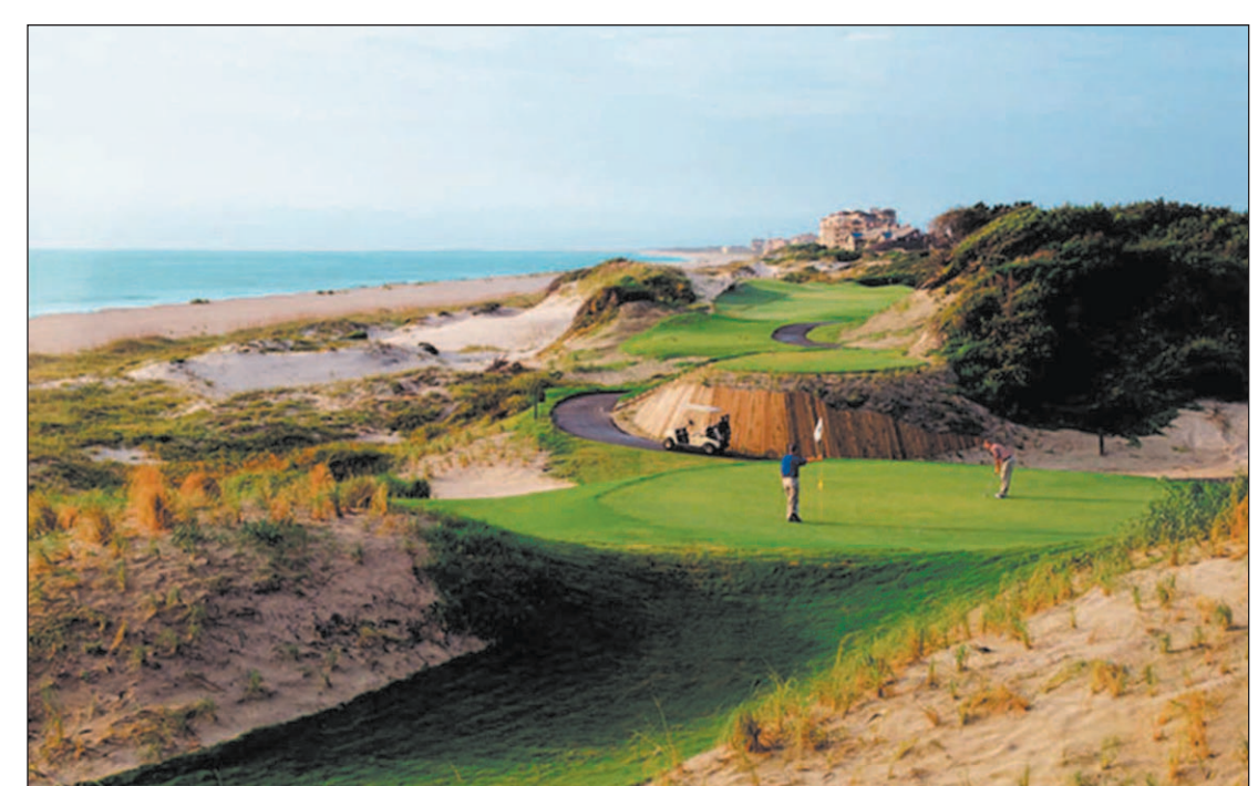
The Amelia Island Plantation, above, is conveniently located just 30 minutes from Jacksonville, Fla., and boasts all-ages amenities and activities. Below, visitors enjoy a vast golf course overlooking the ocean. At top, guests take advantage of one of the plantation's 23 pools.

comfortable bed-like table. But this AAA fourdiamond resort for 23 years